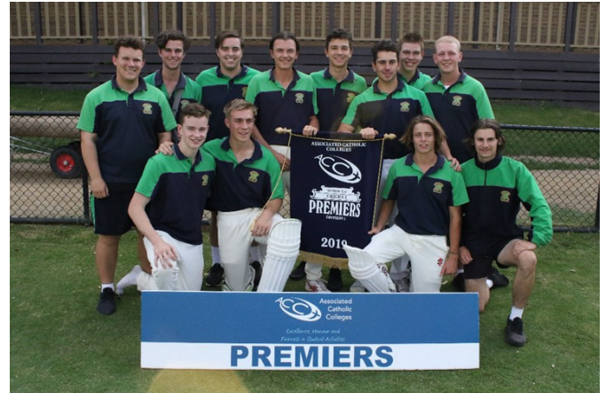
Above: Parade College - 1 st XI Cricket Premiers 2019

The ACC Senior Cricket, Tennis and Volleyball seasons are now complete with finals taking place two weeks ago.