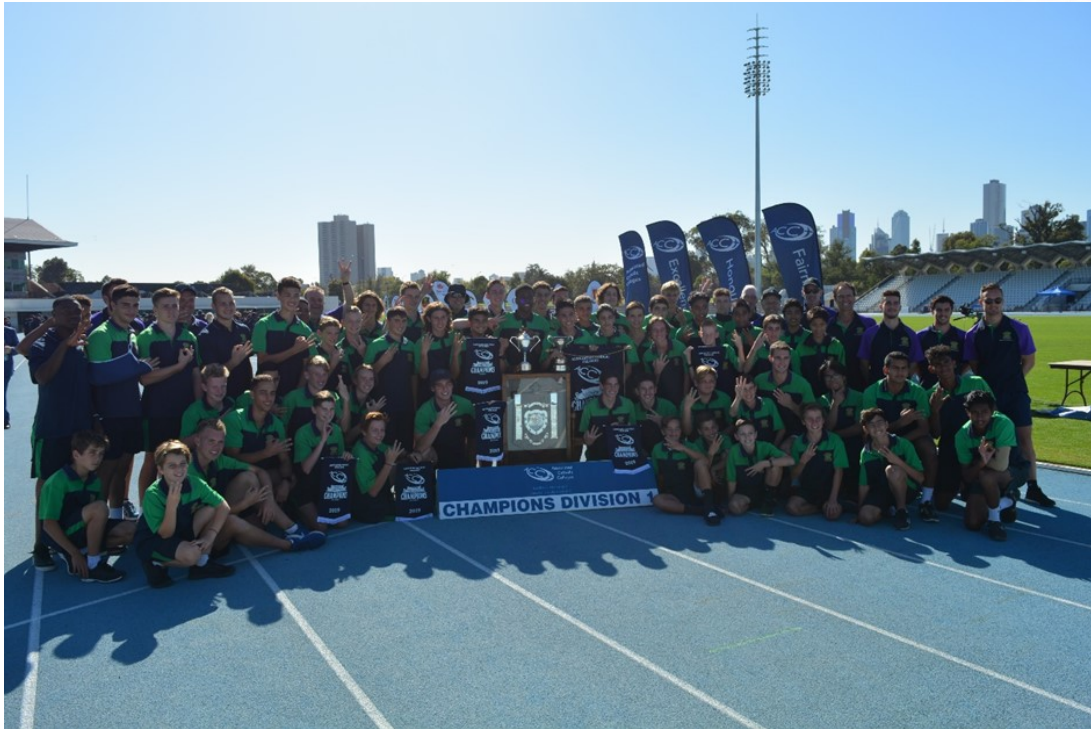
2019 ACC Athletic Champions - Parade College