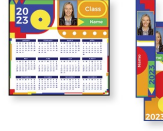
Calendar & Bookmarks