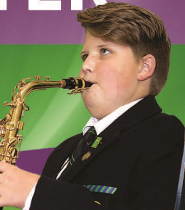
A WORLD OF OPPORTUNITIES FOR YOUNG MEN