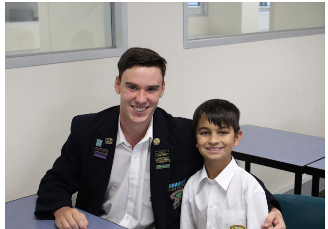
Above: Year 7 students working with their Year 12 mentor as part of the Failte Program