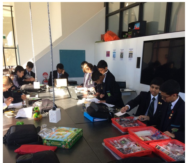
Above and below Students working in the NLC spaces