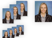
Portraits in a variety of sizes

Products at a discounted price! (* Product/Group photo type depends on school )