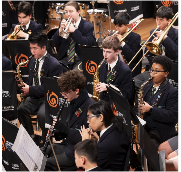
Above: The Concert Band performing at the Victorian Schools Music Festival