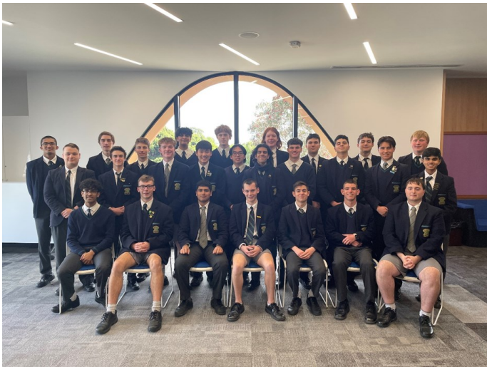
Above: Our prospective 2025 Prefect Team taking part in their retreat

Throughout Term 3, our prospective 2025 Prefect Team has been actively engaged in the Prefect Preparation Program, culminating in a transformative two-day retreat centred on the core principles of servant leadership. This comprehensive program has provided our emerging leaders with the opportunity to deepen their understanding of the profound responsibility and privilege that come with their roles. It has also allowed them to bond as a cohesive team while developing the essential skills required to be effective student leaders.