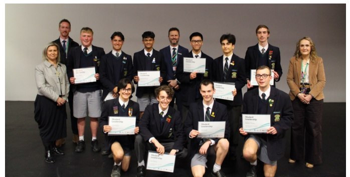
Above: Our Year 10 and 11 Northern Education Alliance Senior Student Leadership representatives

Participating schools include Mernda Central College, Plenty Valley Christian College, Hazel Glen College, Marymede Catholic College, and Ivanhoe Grammar.