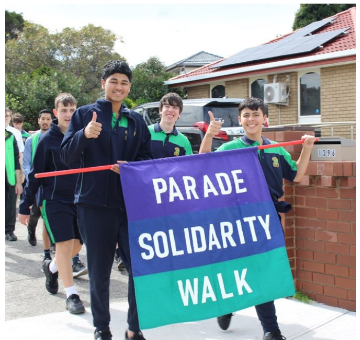
Above: Students taking part in this year's Solidarity Walk

On Friday 6 September, our school community came together for the Annual Solidarity Walk, an event that is a powerful expression of our commitment to social justice, inclusion, and unity. This year's walk was particularly meaningful as students and staff joined forces to raise awareness and show support for Edmund Rice Camps.