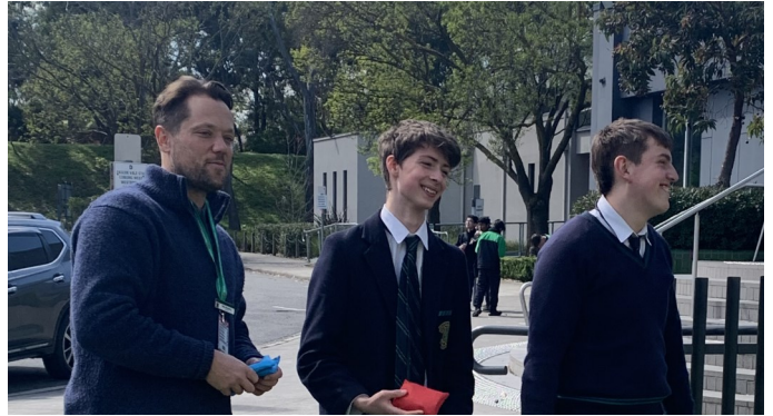
Above: Students and teachers enjoying a game of cornhole for R U OK? Day

Our school community came together to acknowledge R U OK? Day. The day is dedicated to promoting mental health awareness and the importance of checking in on each other.