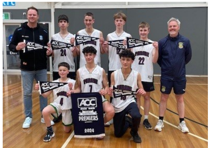
Above: The Year 8 1A Basketball Premiers