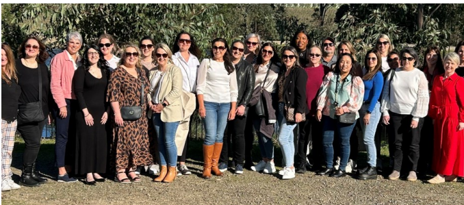
Above: Parents enjoying a day out at Rochford Estate

We were privileged to have fantastic weather, a great group of families and amazing food at the Rochford Estate. It was an enjoyable day for us all.