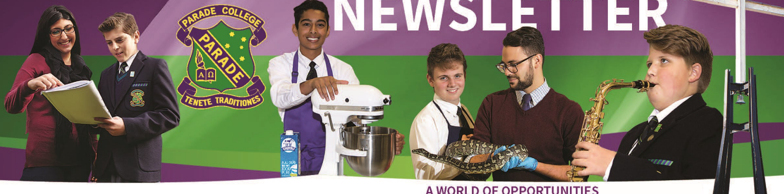
A WORLD OF OPPORTUNITIES