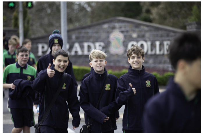
Above: Students taking part in this year's Solidarity Walk

This event is an opportunity for our students and staff to reflect on our greater purpose and to recognise, via a lived experience, the EREA Touchstones of Gospel Spirituality and Inclusive Community .