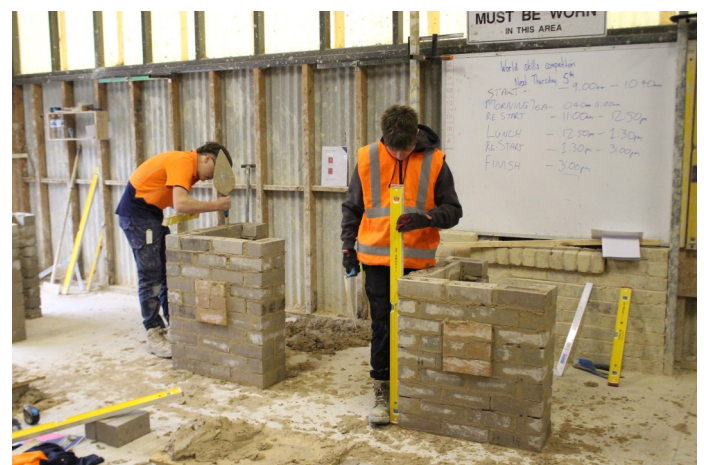
Above: Parade students competing in the VETIS Bricklaying World Skills Competition

VET bricklaying students from four schools, including Parade College, came together. It was clear the competitors were here to compete fiercely and, right from the start, they put their skills to the test in an epic battle of bricks and mortar.