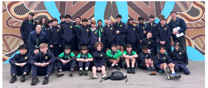
Above: The Year 8 Altior Science class on excursion to Melbourne Museum

We proceeded to the rocks exhibit and began filming our rockumentaries. After about 20 minutes, we were called back to the editing room to refine our footage.