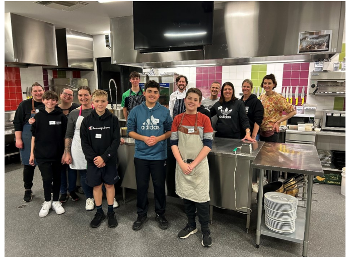
Above: Parents and students getting together cooking for charity

Each year, POP has a fundraiser where families can purchase pavers that are laid at the school with family names or memories captured on them. You may wish to celebrate the