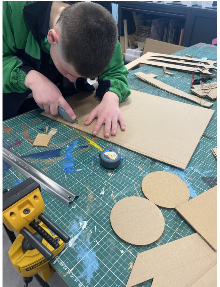
Above: Year 10 Max W. B20 creating their prototype

The students were involved in a variety of prototyping ideas, with computer-aided design leading to 3D printing and laser cutting, along with cardboard prototyping.