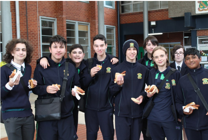
Above: Students enjoying Solidarity Day at Preston Campus

The Preston Campus came alive on Solidarity Day! So much was on offer for our boys to participate in, there was a volleyball match between staff and students. The handball competition proved to be very popular, with many receiving prizes for their efforts.