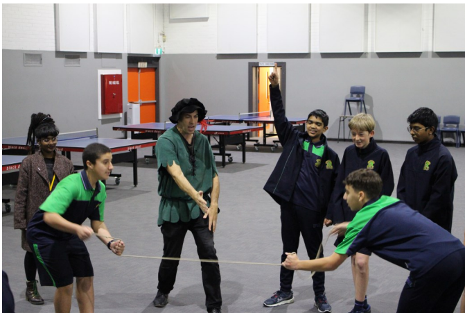
Above: Students participating in a medieval game