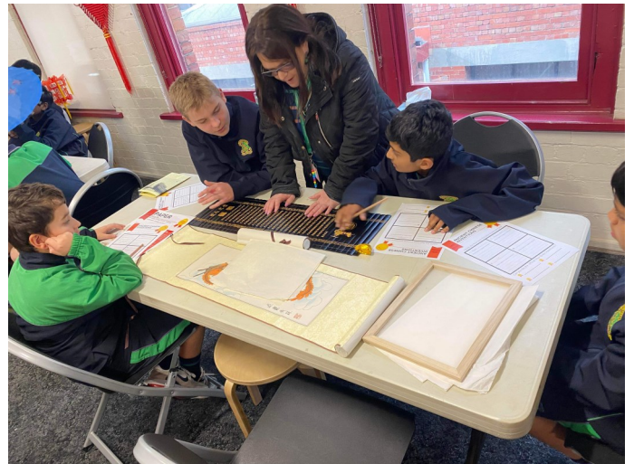
Above: Year 7 Altior Students participating in activities at the Chinese and Australian History Museum

On Monday 17 June the Year 7 Altior class were fortunate enough to go to the Chinese and Australian History Museum in Melbourne. We learned a lot about the gold rush and how it was tied together with Chinese history as a lot of Chinese people immigrated to Australia for the gold rush.