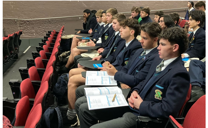
Above: Students taking part in the Business Explorer Day at Victoria University

Victoria University Business Explorer Day saw several Parade Commerce students partake in a variety of business, economics, and finance classes at Victoria University's City Campus.