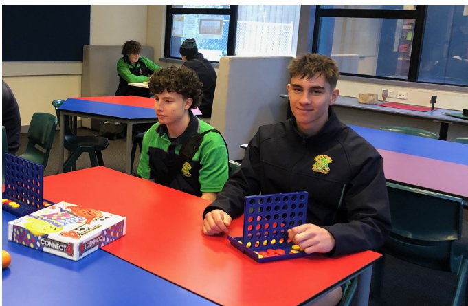
Above: Students playing board games in the CCLC at Lunchtime

Due to the cold weather, many of our students are utilising the CCLC space to sit, relax with friends and play many of the board or card games on offer.