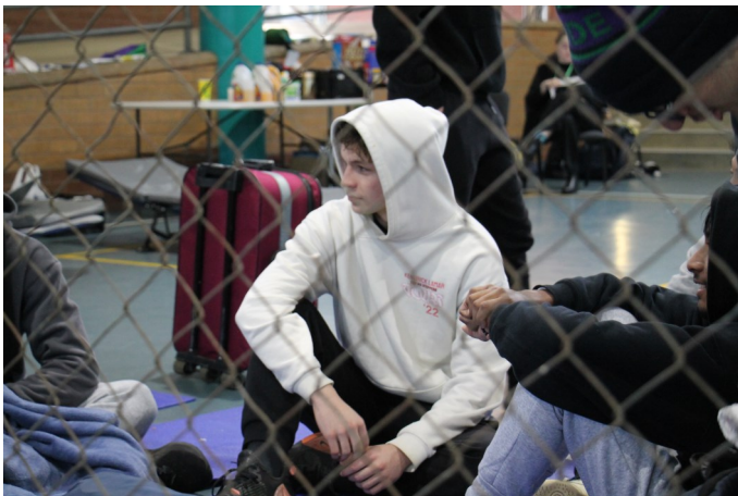
Above: Students participating in The Cage

The students spent 24 hours in a makeshift cage, mirroring the harsh conditions faced by many refugees. This powerful act not only highlighted the urgent need for humane treatment and support for those seeking asylum but also fostered a deep sense of solidarity and responsibility within our school community.