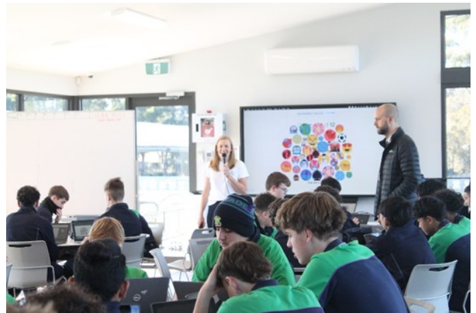
Above: Students Participating in the Year 9 Development Day

Our Year 9 students took part in tailored activities during a Development Day at the end of Term 2 on Wednesday 19 June. The day focused on the areas of cyber safety, mental health, resilience, and physical health, ensuring students can navigate digital spaces responsibly, maintain emotional wellbeing, and adapt to challenges.