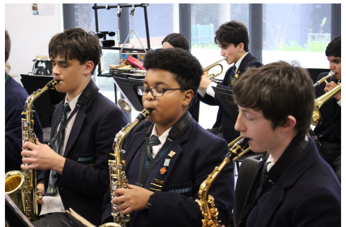
Above: Students rehearsing for the upcoming assembly

A reminder that if you are unable to attend a lesson or ensemble rehearsal advanced warning is needed by contacting your child's music teacher directly, notifying the College Reception, or emailing us at music@parade.vic.edu.au .