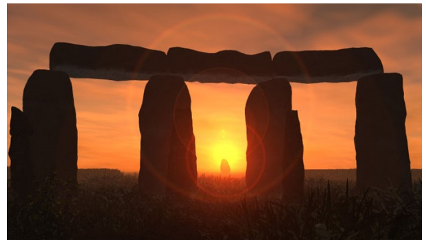
Solstice sunrise at Stonehenge