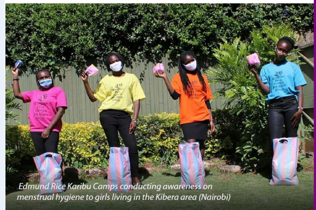
Edmund Rice Karibu Camps conducting awareness on menstrual hygiene to girls living in the Kibera area (Nairobi)