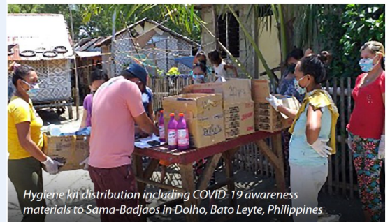
Hygiene kit distribution including COVID-19 awareness materials to Sama-Badjaos in-Dolho, Bato Leyte, Philippines