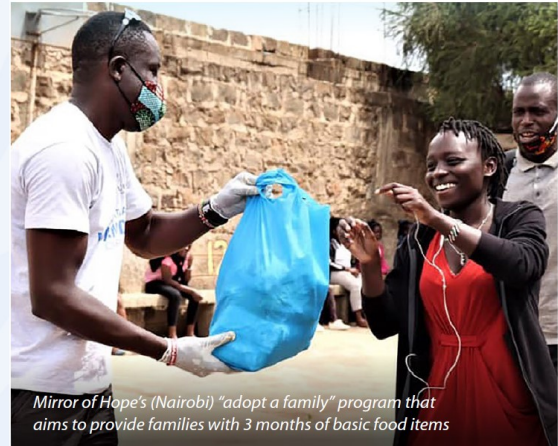
Mirror of Hope's (Nairobi) "adopt a family" program that aims to provide families with 3 months of basic food items

📞 07 3621 9649 ✉ info@erf.org.au 🌐 www.erf.org.au