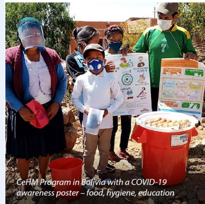
CeHM Program in Bolivia with a COVID-19 awareness poster – food, hygiene, education