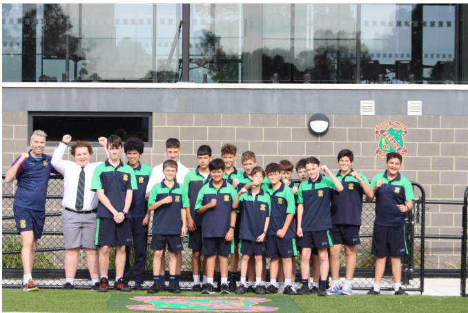
Above: A fantastic effort from B16, raising $2842 for the Nzara Hospital in South Sudan.

It was an amazing experience and one of my favourite parts of B16.