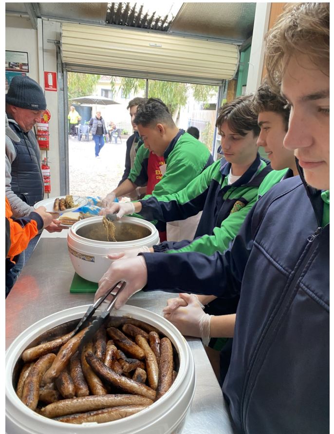
Above: Students helping out at the Exodus Community

The first of the Year 11 Touchstones classes completed their 3-week volunteer placements through May and June. Students are given options to volunteer their time in a school-based program such as the Eddy's Back Packs Program, the Waterford Garden, and various Sustainability projects. Others chose to volunteer with community organisations such as The Big Group Hug, Aged Care facilities, and The Exodus Community Centre.