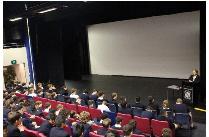
Below: Year 8 and 9 Counselling and Wellbeing Presentations that were held on Friday

Year 8 and 9 students engaged with our Counselling and Youth Worker Team during their Pastoral Care period last Friday. Our Counselling Wellbeing Team explored areas around mental health and the impacts this can have on our daily lives. The students were reminded about the support the College offers for all students and the preventative support groups and workshops available each Term.