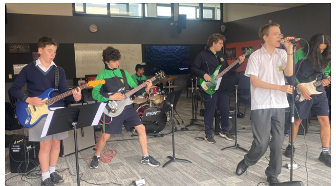
Above: Students competing in the Battle of the Bands.

We had three bands competing for the top prize this year with students from all year levels entering. Each band was required to perform two songs – one of their own choosing and a reimagining of Are You Going To Be My Girl by the legendary Australian band Jet.