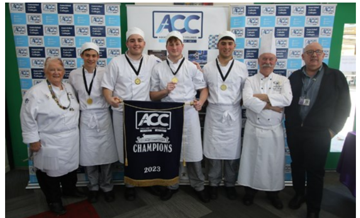
Above: Our ACC Culinary Champions

Parade served Sous Vide Pork Fillet with Autumnal Vegetables and a Deconstructed Apple Crumble.