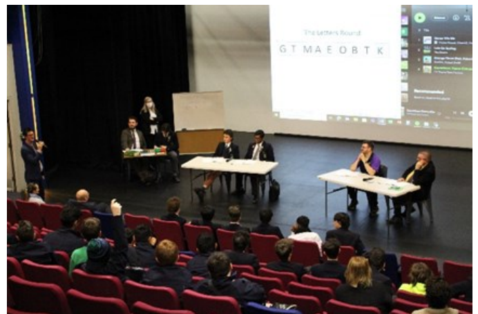
Above: Students Vs Staff Letters and Numbers