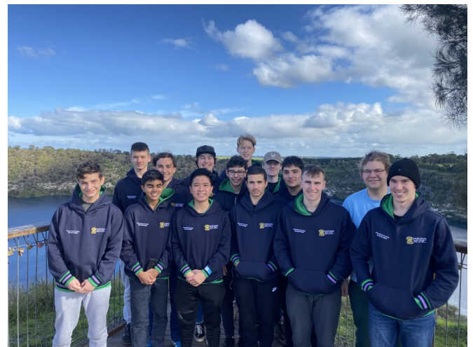
Above: Students taking part in the Generations of Jazz in Mount Gambier.

The students performed extremely well and placed fourth for the division which is a commendable effort for a national competition.