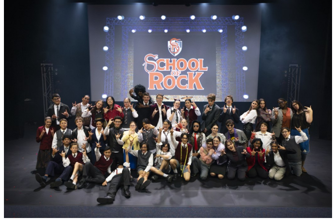
Above: The School of Rock Cast

- Dewey Finn, 'School of Rock - The Musical